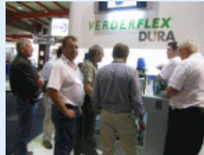
Verderflex VF125 still proves to be a show-stopper