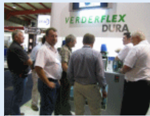
VPSA team provided technical advice on pumping applications

Full-scale production of the newly launched Dura35 pump range will begin in January 2009, at the company's manufacturing facility in Leeds, UK. A number of units, however, will be made available to the local market in the current quarter.