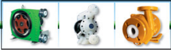
VERDERFLEX® VERDERAIR® VERDERMAG®